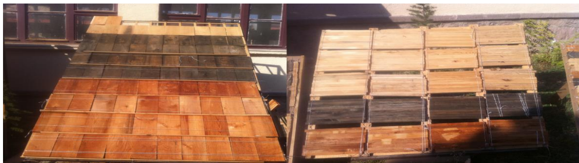
Figure 1. Inclined platform of test samples stored in the outdoor conditions

The height of the test samples at the lowest level is 50 cm, care has been taken that organic wastes will increase the proportion of water in the soil unnecessarily and that there will be no water-holding residues.