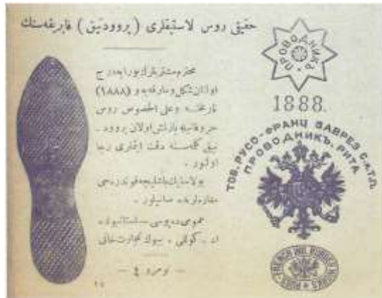
Picture 8: Genie Russian rubber from the Provdnik factory. Look for logo Available only in exclusive stores Distributed from Büyük Ticaret Han, İstanbul 1904