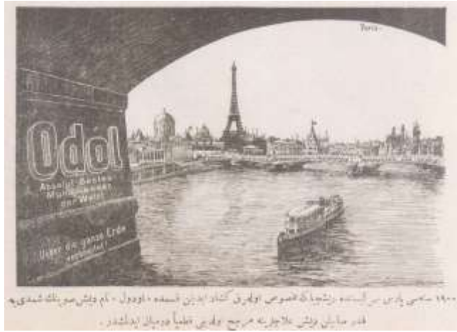
Picture 7: People prefer this brand more than any others Dental water "Odol" 1903