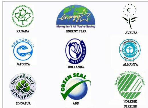
Figure: 1 Examples of Some Countries' Eco-Label Logos

Resource: www.utexas.edu/research/ceer/che302/greenproduct/pages/whatisgreenproducts.htm